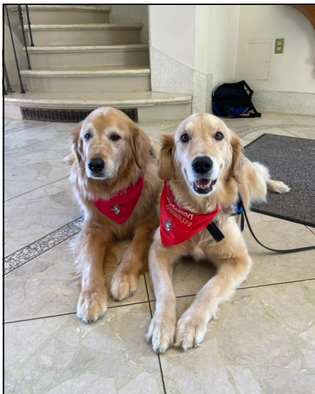
Abraham and Beloved for National Dog Day!