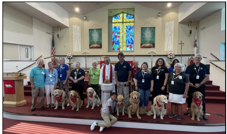
All together for a Pastor Installation