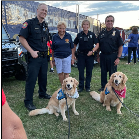
National Night Out